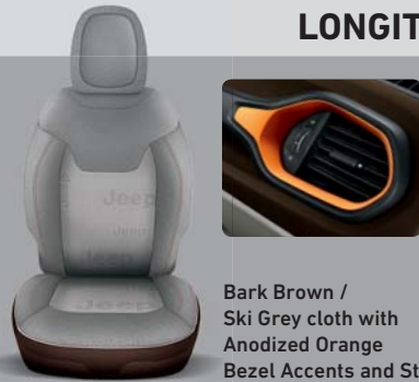
Bark Brown / Ski Grey cloth with Anodized Orange Bezel Accents and Stitching