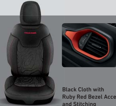
Black Cloth with Ruby Red Bezel Accents and Stitching