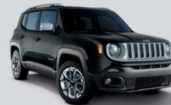
Carbon Black Metallic