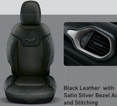
Black Leather with Satin Silver Bezel Accents and Stitching