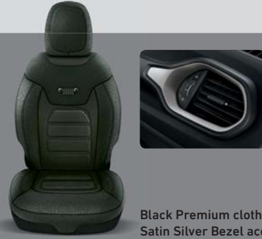
Black Premium cloth with Satin Silver Bezel accents