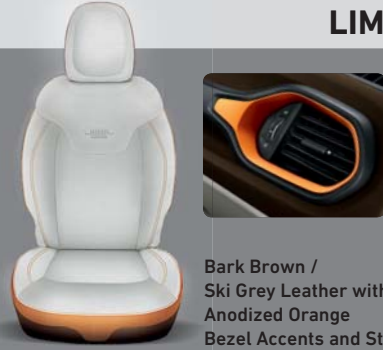
Bark Brown / Ski Grey Leather with Anodized Orange Bezel Accents and Stitching