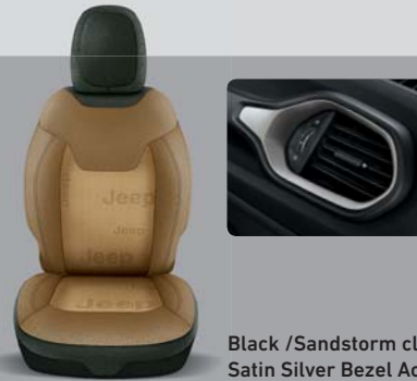
Black / Sandstorm cloth with Satin Silver Bezel Accents