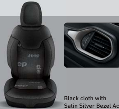
Black cloth with Satin Silver Bezel Accents