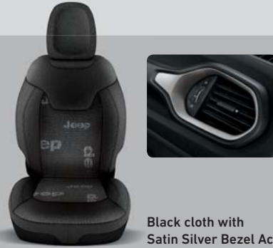
Black cloth with Satin Silver Bezel Accents